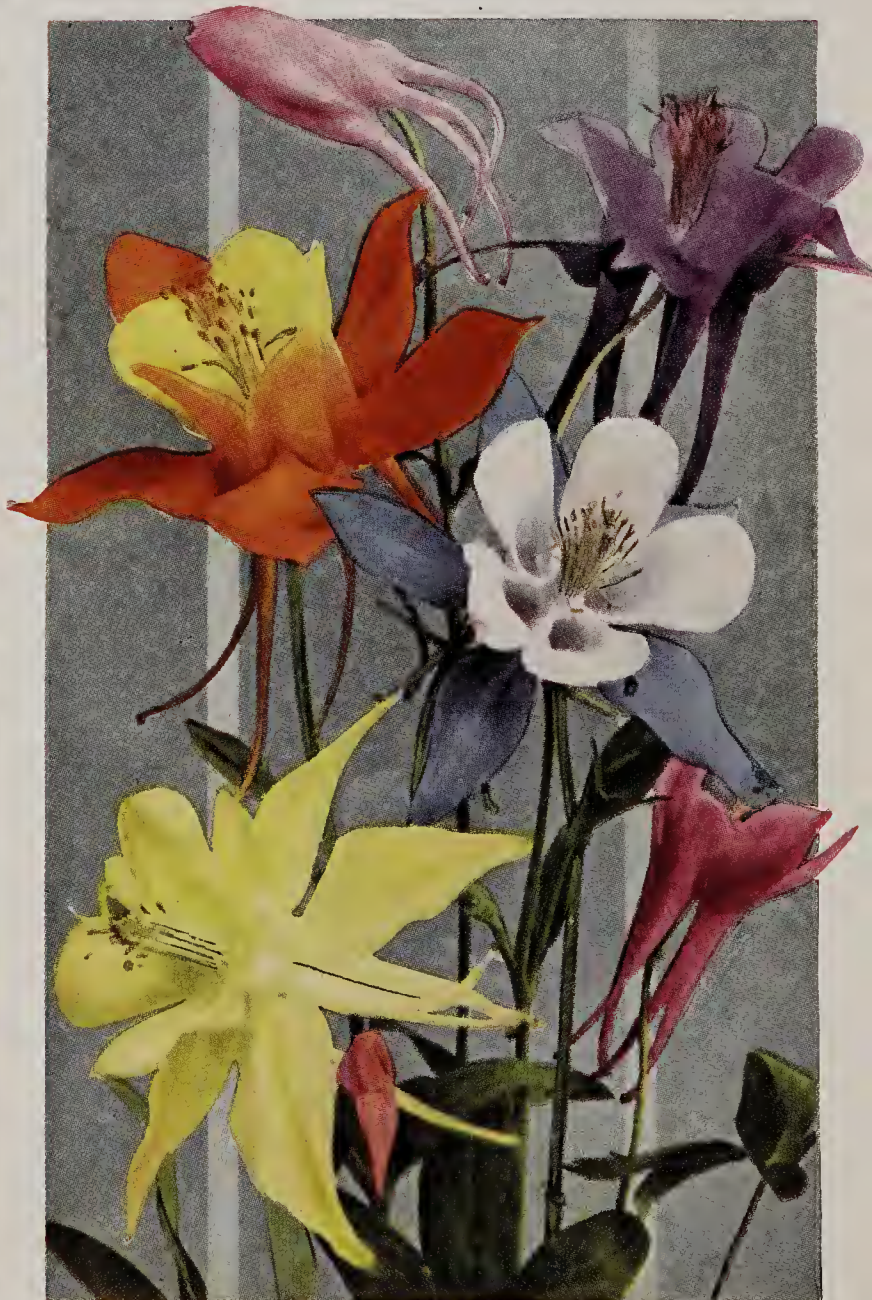
Aquilegia (Columbine). Burbank's New Hybrids. 50 cts. each

COLLECTION: 2 each of above 5 Perennials (10 plants), for $3.90 , regular price $4.80 1 each of above 5 Perennials (5 plants), for $2.10 , regular price $2.40